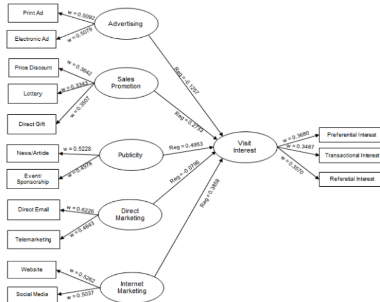
Figure 2: The results of PLS Bootstrapping – XLSTAT 2018

0.2012, t is 1.9175 and Pr > |t| is 0.0582. Further, Figure 2 presents the diagram of bootstrapping result.