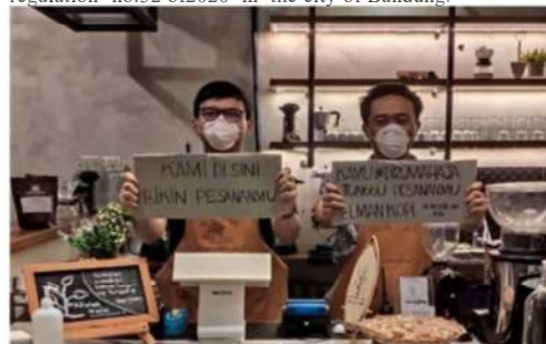
Figure 1.2 below is an example of implementing regulation no.32 of 2020 in the city of Bandung.

Perwal, Number 32 of 2020 also emphasizes that the main operational requirement is that the number of visitors is only 30 percent of the total capacity restaurant or restaurant. Through this regulation, the Bandung City Government hopes that restaurant managers and visitors will continue to implement health protocols such as wearing masks, washing hands, and maintaining distance. Figure 1.2 below is an example of implementing regulation no.32 of 2020 in the city off a restaurant or restaurant. Through this regulation, the Bandung City Government hopes that restaurant managers and visitors will continue to implement health protocols such as wearing masks, washing hands, and maintaining distance.